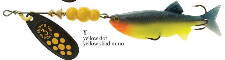
Y yellow dot yellow shad mino