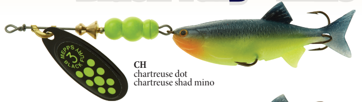
CH chartreuse dot chartreuse shad mino

Black Fury® Minos excel in low light conditions, making them second-to-none in early morning, evening or overcast skies. These spinners are a perfect choice for sunny days when you want contrast with the brightness of the water, weeds and structure.