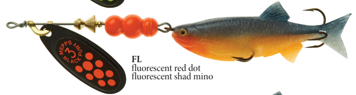
FL fluorescent red dot fluorescent shad mino