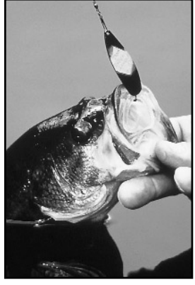
Big bass find it hard to resist a Mepps #0 or #1 Timber Doodle rigged with a Mister Twister Split Double Tail.

Mister Twister® Split Double Tails with you as these toothy critters will quickly tear them to shreds.